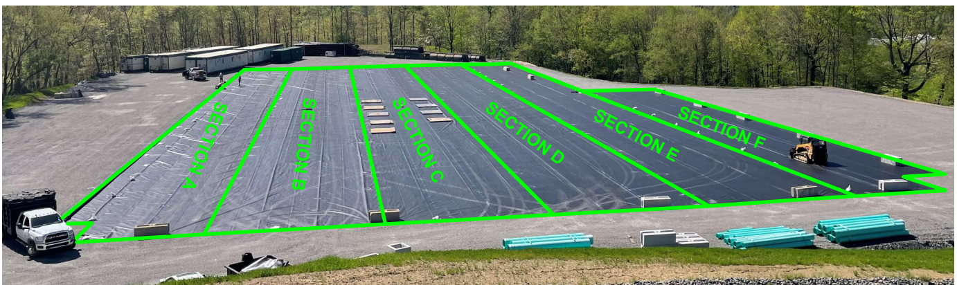
Above: Overlay showing the fabrication match to the CAD rendering as the pad was laid out in the field.