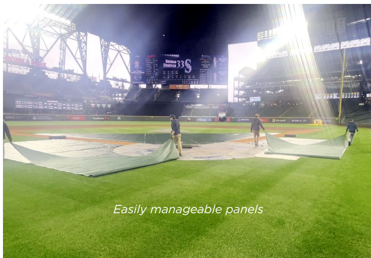
Easily manageable panels