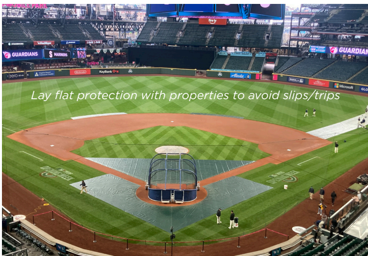
Lay flat protection with properties to avoid slips/trips