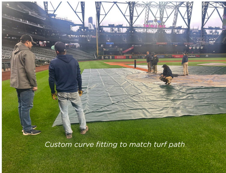
Custom curve fitting to match turf path