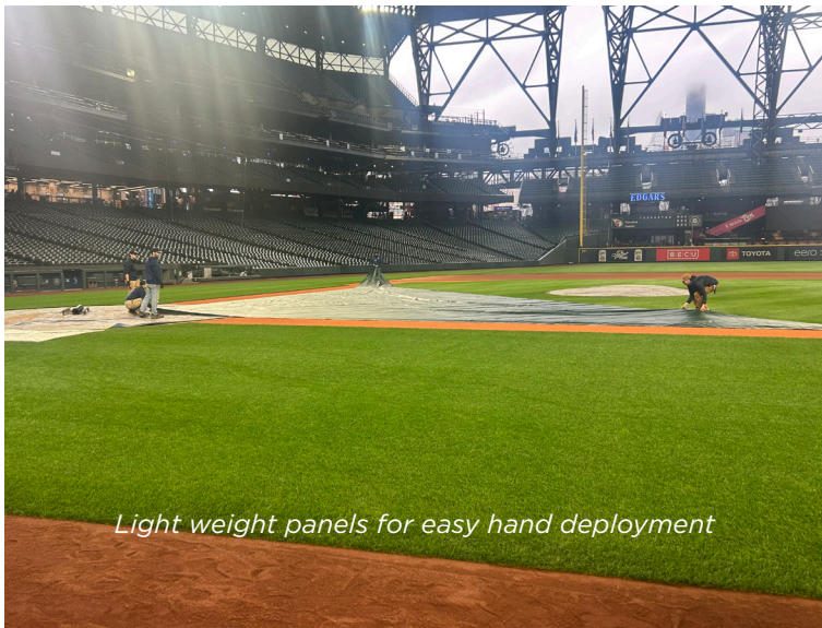
Light weight panels for easy hand deployment