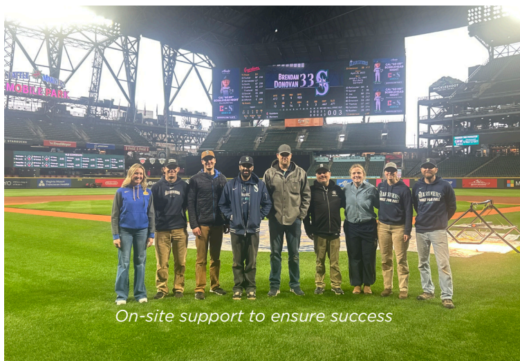
On-site support to ensure success